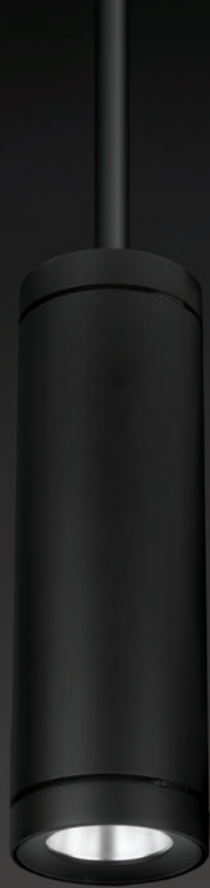
Pendant Stem Nano 9"