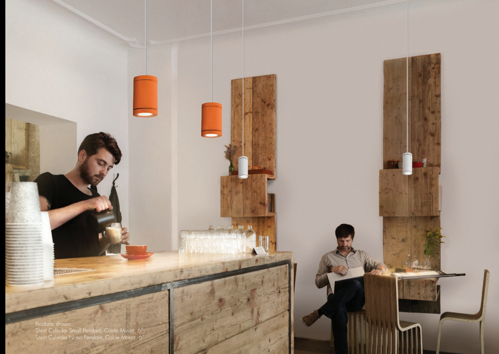
Products shown: Short Cylinder Small Pendant, Cable Mount, 6" Short Cylinder Nano Pendant, Cable Mount, 6"

The option of an integrated, remote, or surface-mount driver puts the Lumenpulse Nano and Small Cylinders exactly where you want them to be. The remote driver can be placed more than 50' away, ensuring a low profile for the luminaire.