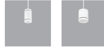
short cylinder nano pendant