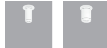
short cylinder nano surface mount