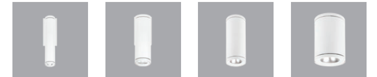
cylinder nano wall mount

wall mount (direct, indirect and direct/indirect)