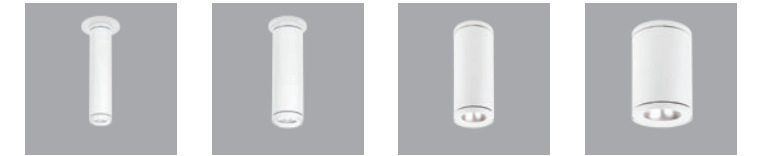
cylinder nano surface mount