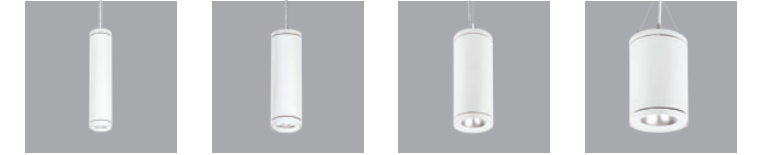
cylinder nano pendant