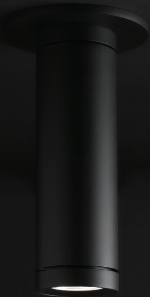
Product shown: Short Cylinder Nano Surface Mount, 9"

Completely control agnostic with best-in-class outputs of up to 2000lm and color temperatures from 2200K to 4000K. What this means for the educational, corporate, retail, and hospitality sectors is a quality of light that will give each space a signature unlike any other.