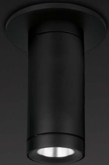
Surface Mount Nano 6"