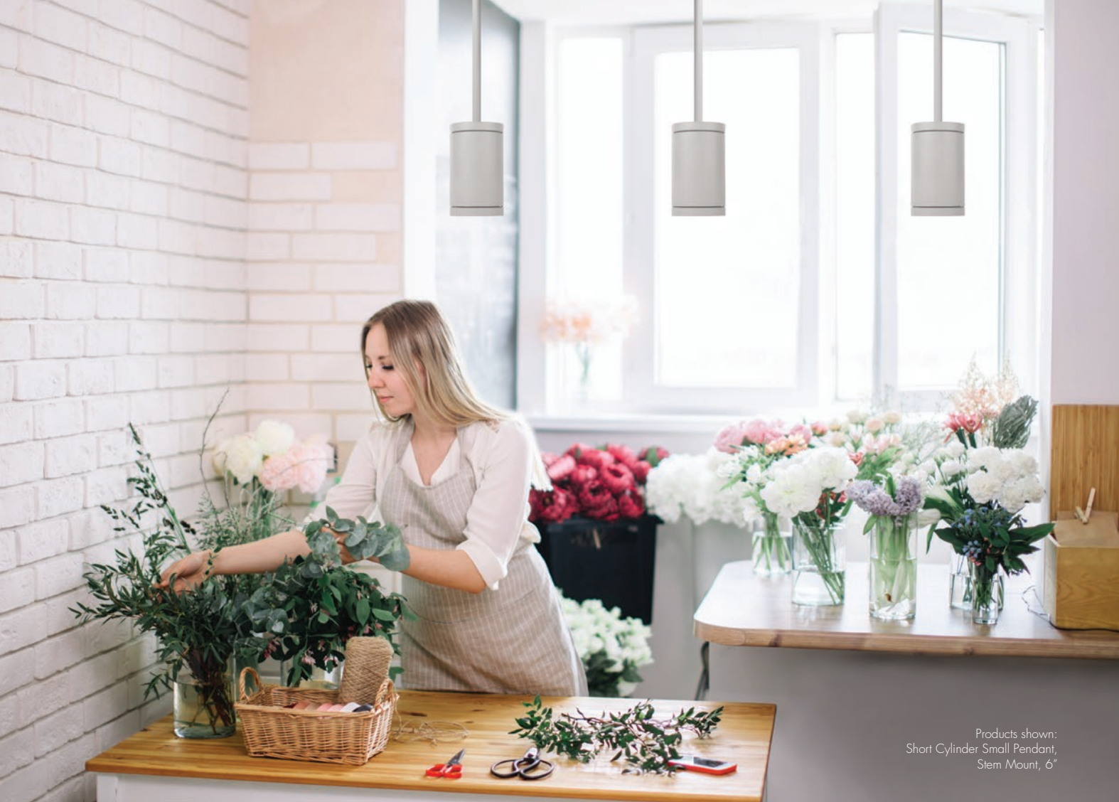
Products shown: Short Cylinder Small Pendant, Stem Mount, 6"